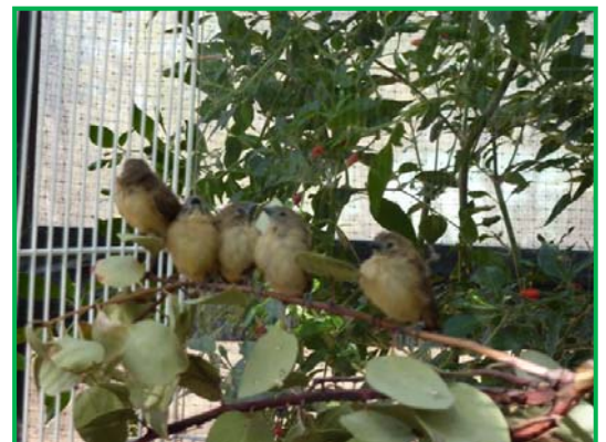
“5 Newly Fledged Chicks”

These are gentle birds in a mixed collection of small finches.