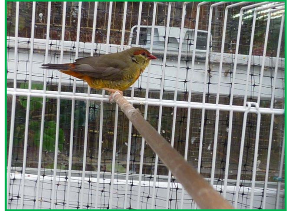
“Adult Goldbreast Cock”

I bred this species on my sun porch for several years in a collection of other small finches. The Goldbreasts then started having trouble with egg-binding. I was afraid I would lose the females because every time I put them in my sun porch to breed they would get egg-bound. They ended up in a hospital cage until they passed the egg. Then I put them in a cage in the house to recover. Fortunately, a small change in their feeding regimen during breeding seems to have solved this problem.