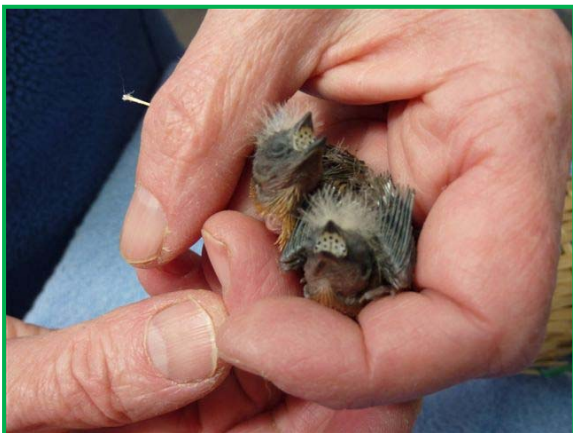
“10 Day Old Chicks”

The eggs are incubated for 12 days. Sometimes I use a borescope to check on the progress of a nest. 3 I have made a chart to keep track of how long incubation takes for this species, days to fledging, and the length of their dependence on their parents. I write these details on a calendar so I am able to anticipate their needs.